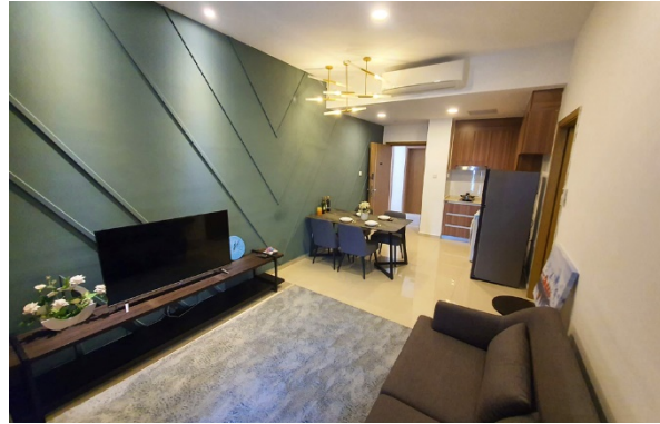
Property Interior Photo